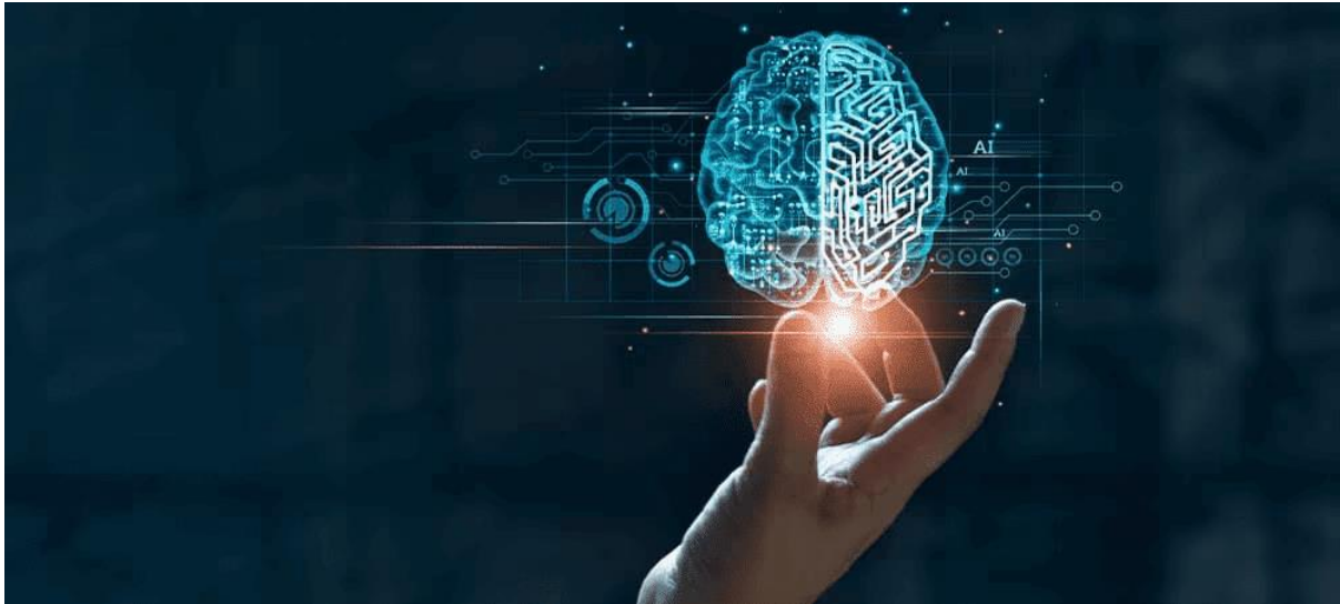
Fig:1 AI The Future of Education