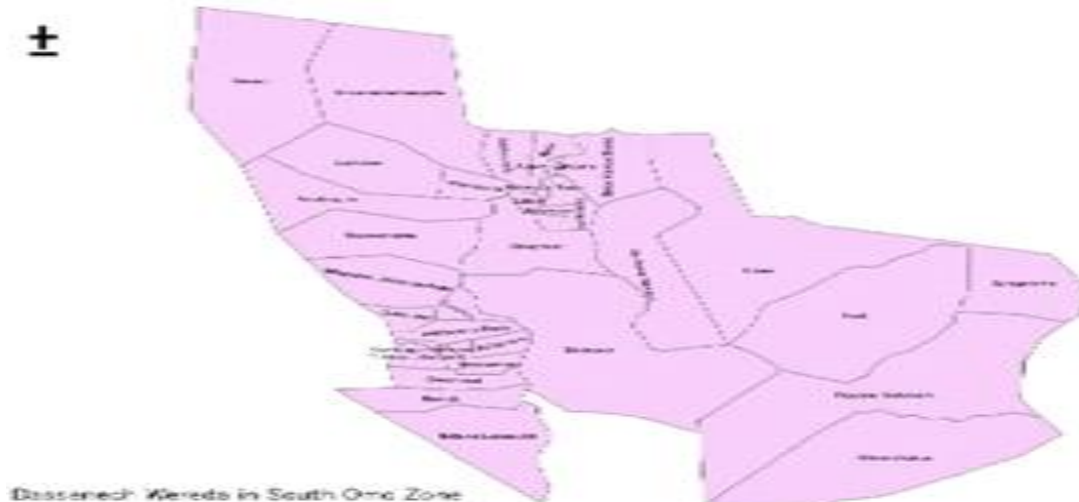
Fig 1: Map of Dassenech Woreda