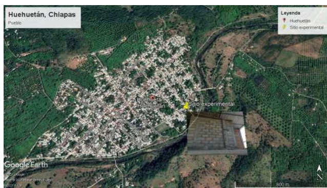
Figure 1. Geographic location of the study area.

The research was carried out in the municipality of Huehuetán, in the state of Chiapas. The experimental site is geographically located at 15^{\circ}22'40,96'' LN and -92^{\circ}22'40,96'' LO with an altitude of 65 masl, as shown in Figure 1.