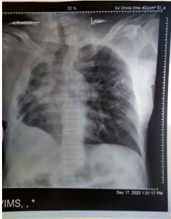
Fig No 2: Chest Xray suggestive of sequelae of pulmonary Koch's.