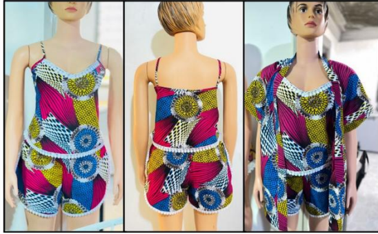
Figure 6: Design on a mannequin in a two-dimensional view

The third design on the mannequin consists of three views: front, back, and morning coat, as well as the inner garments of the nightwear. The inner has a round ‘V’ neckline, while the kimono-sleeved morning coat has a self-belted attached. The fabric used was an all-over motif African print fabric. The collection was inspired by the theme Night of Passion and the fashion trends of existing nightwear, and the resultant colour story was derived from the theme board of a beautiful blend of pink flowers, which also determined the mood and has been featured skilfully in the fashion look created. Collections are typically inspired by a theme and developed based on factors like colour, fabric, design details, or a purpose that links the items together.