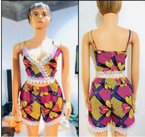
Figure 4: Design on a mannequin in a two-dimensional view

The first design shown in Figure 4 is an overlapped front opening with strapped sleeves for nightwear. It has a 'V' neckline; the design was finished with cotton white lace trimmings. The fabric used to construct the nightwear was an all-over motif African print fabric.