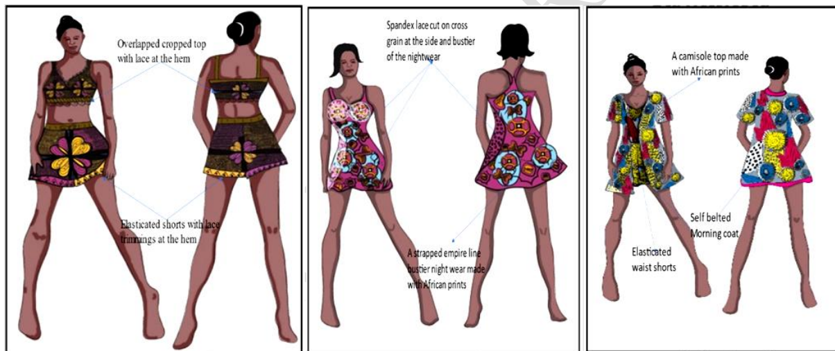
Figure 3: Design boards the three designs

The design board in Figure 3 illustrates the front and back views of the designs with fabric and colours.