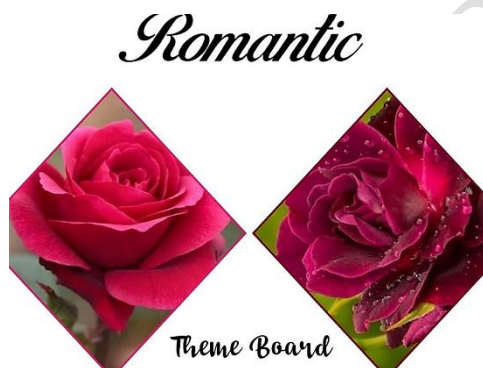
Figure 1: Theme Board

The title Romantic Collection is inspired by the theme Night of Passion.