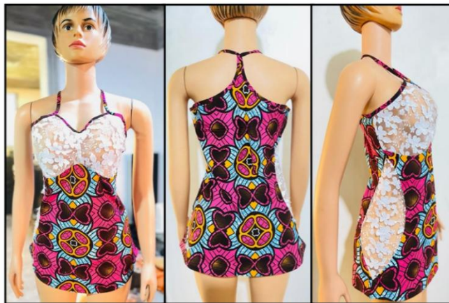
Figure 5: Design on a mannequin in a two-dimensional view

The first design shown in Figure 4 is an overlapped front opening with strapped sleeves for nightwear. It has a 'V' neckline; the design was finished with cotton white lace trimmings. The fabric used to construct the nightwear was an all-over motif African print fabric.